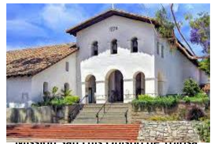
Mission San Luis Obispo de Tolosa

A Pet Ceremony will take place on Dec 1 at 6PM at the Hospice Office in downtown SLO.